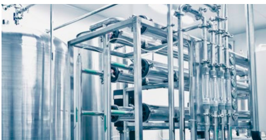
e.g. food production