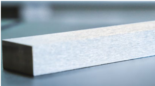
polished profiles ...